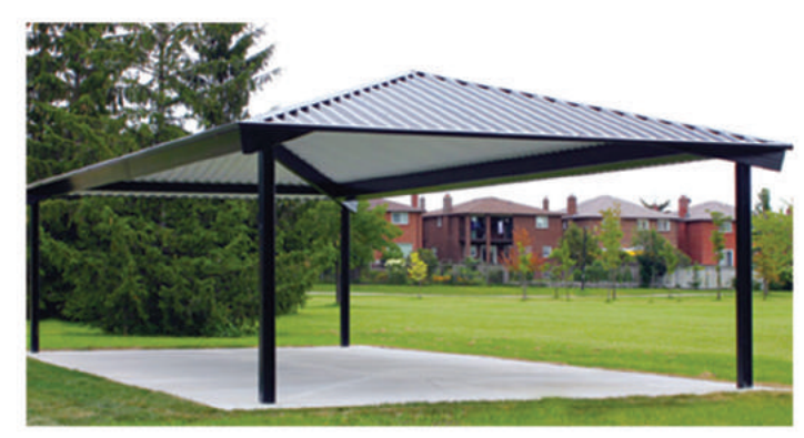
Tier 6 - $50,000

If you raise $50,000, you can get the following plus two FREE Tetherball Sets and a Bench: