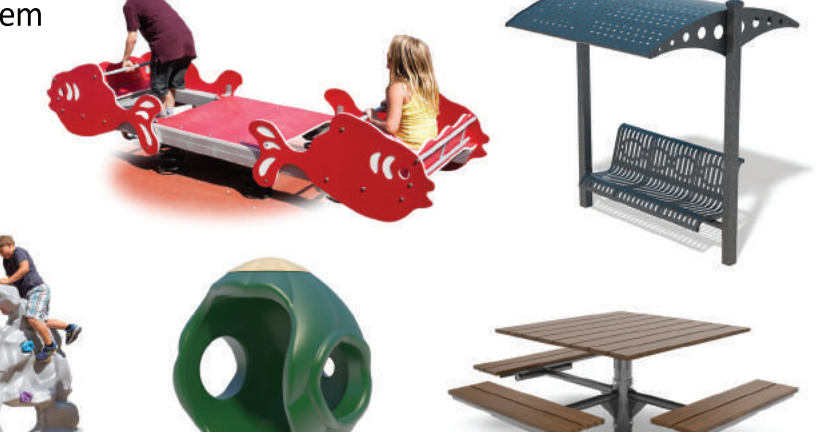
Tier 4 - $15,000

If you raise $15,000, you can get one of the following plus a FREE Seated Super Spinner: